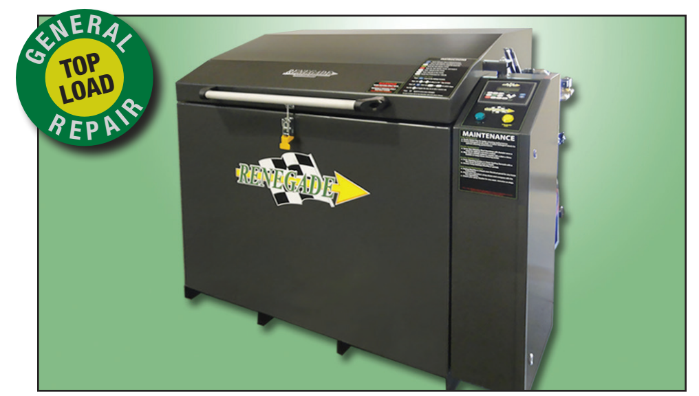
TMB 8100 Dimensions Height: 46 inches; Width: 55 inches; Depth: 49 inches