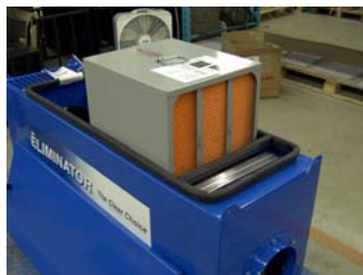
Turbulent Flow Precipitator