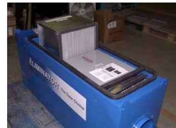
Optional Post Filter 95% ASHRAE , 95% D.O.P., 99.97% HEPA

Available in sizes from 500 cfm to 2500 cfm To find out more about this amazing new technology, visit the web site.